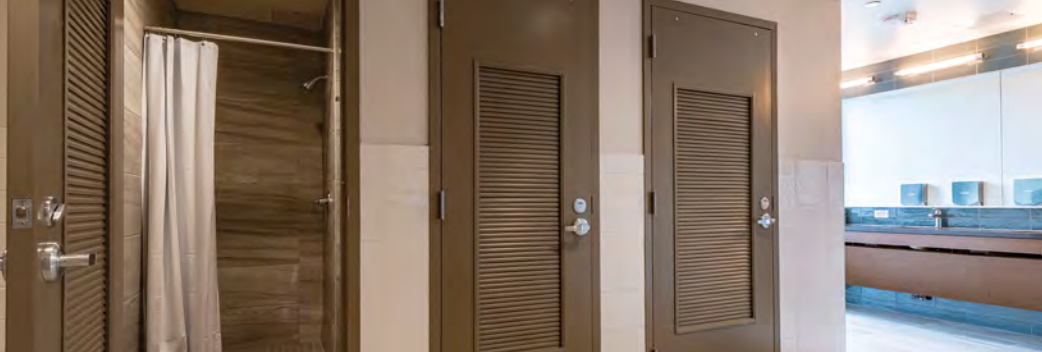
Top image: Gladding Residence Center community-style bathrooms for traditional rooms Bottom image: Gladding Residence Center in-unit bathroom for semi-suite style rooms